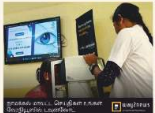
நாமக்கல் மருத்துவ பல் கலைக்கழகம், சென்னை, மாணவிகள் கண பரிசோதனை முகாம்.

பி.ஜி.பி. கல்லூரியில் ஏற்ற அடுத்த பரிசோதனை முகாம் நடைபெற்று, செப்டம்பர் 19-இல் நாமக்கல் பி.ஜி.பி. நர்சிங் கல்லூரி மாணவ, மாணவிகளை படத்தில் காணலாம்.