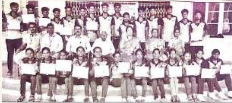
பல்வேறு வினையாட்டுப் போட்டிகளில் பரிசில் ஆளவில் சாதனை படைத்த நாமக்கல் பி.ஜி.பி. நர்சிங் கல்லூரி மாணவ, மாணவிகளை படத்தில் காணலாம்.

பரிசில் ஆளவில் சாதனை படைத்த நாமக்கல் பி.ஜி.பி. நர்சிங் கல்லூரி மாணவ, மாணவிகளை படத்தில் காணலாம்.